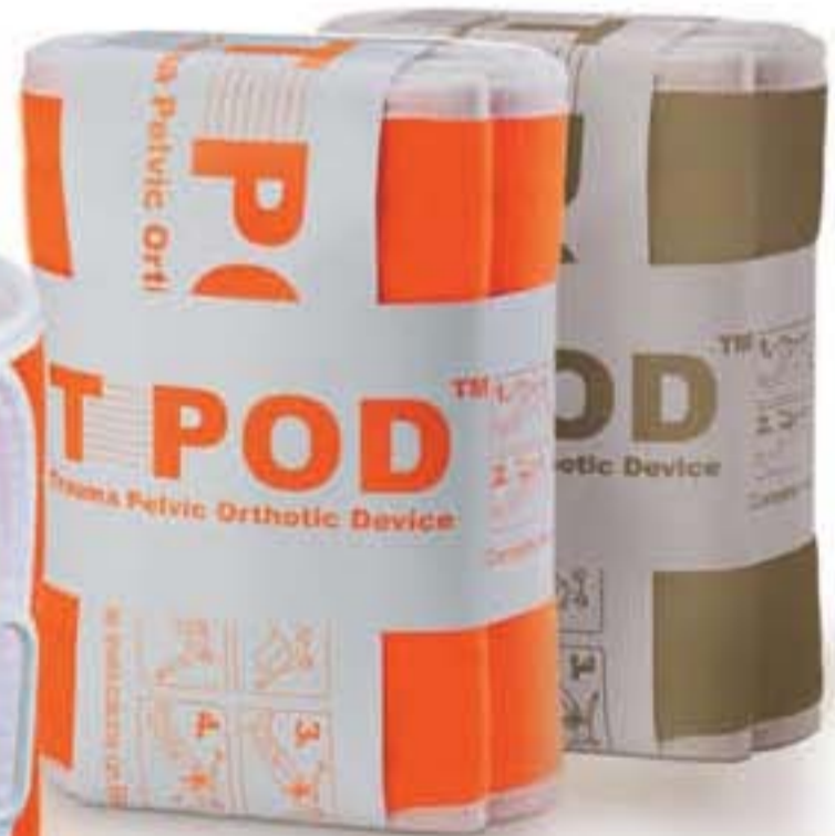
T-POD (Olive Drab) NSN 6515015261175

There are thousands of traumatic pelvic injuries each year in the United States.