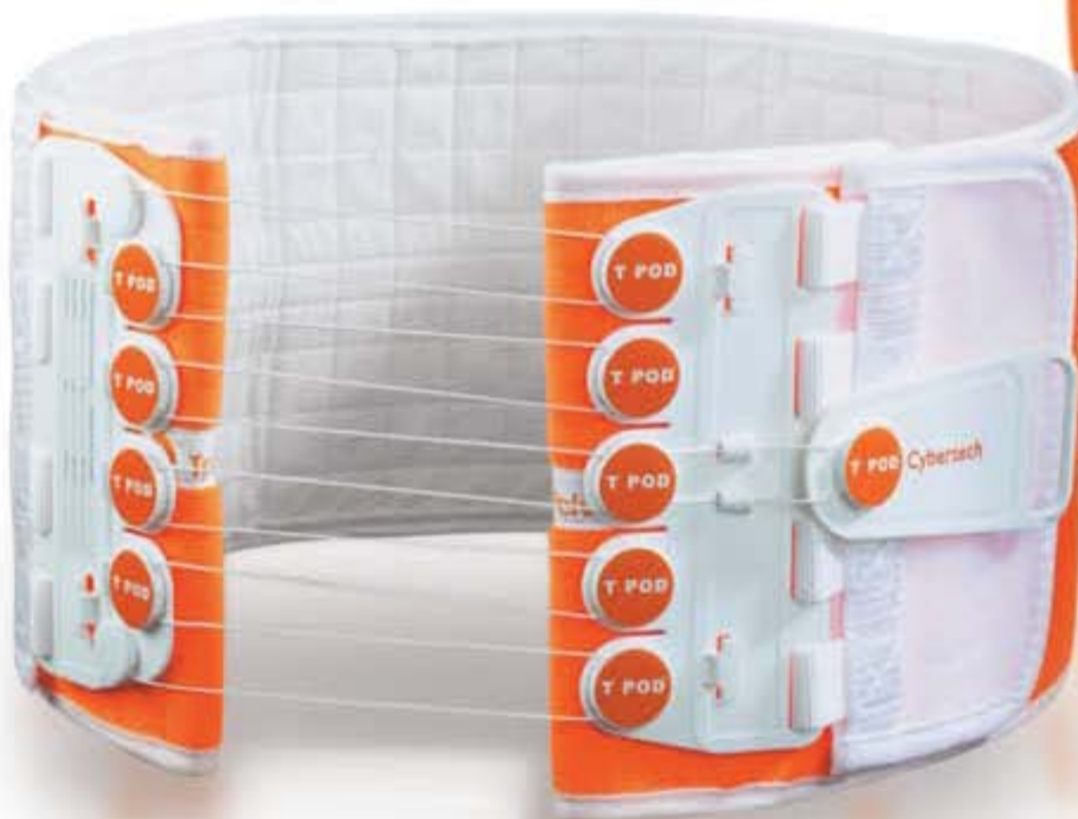
T-POD (Orange) NSN 6515015262788